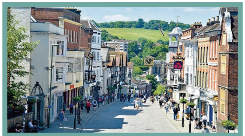
Guildford High Street looks towards the North Downs.